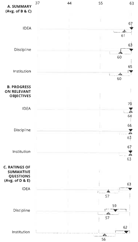
Your Converted Average