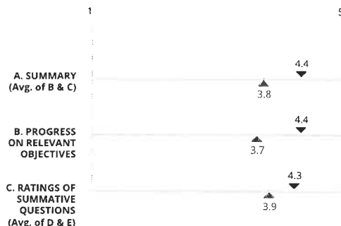
Your Overall Mean Ratings 5 Point Scale